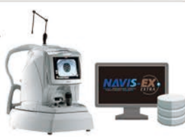
RS-3000 Advance 2